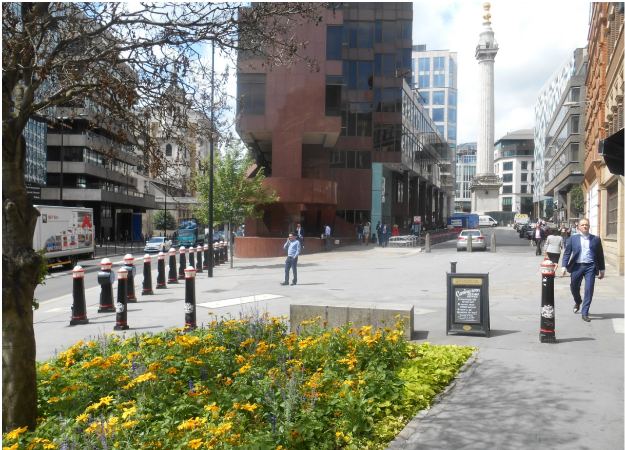
Before - Lower Thames Street/Monument Street Junction