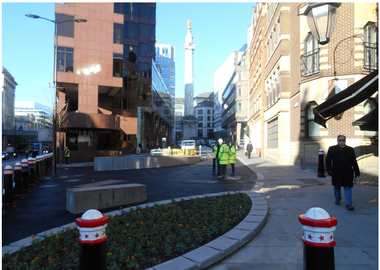
After - Lower Thames Street/Monument Street Junction nearing completion